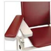
Pivot Arm PR (both models) Dual Pivot Arm P2 (2575 only)