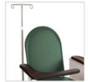
IV Pole IV (right-rear only)