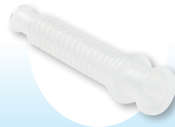
Universal 6" Flex Tube