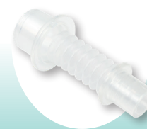
Tracheostomy Adult Flex Connector