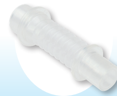
Tracheostomy Pediatric Flex Connector