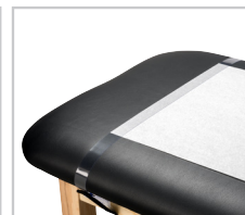
040 Paper Cutter