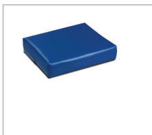
020 Small Pillow