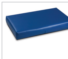
060 Large Pillow