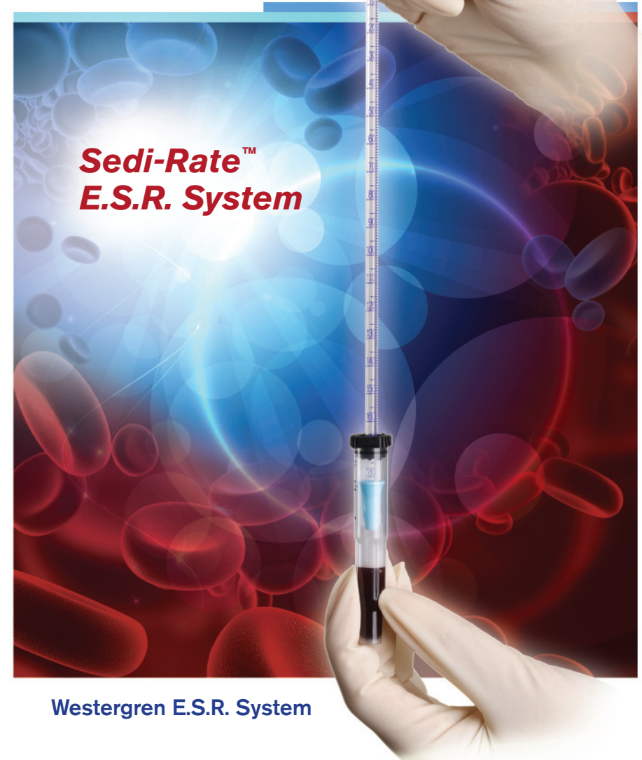
Westergren E.S.R. System