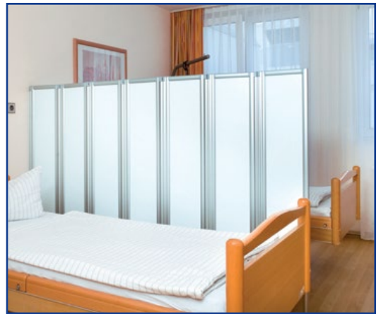
Folding Wall as Partition