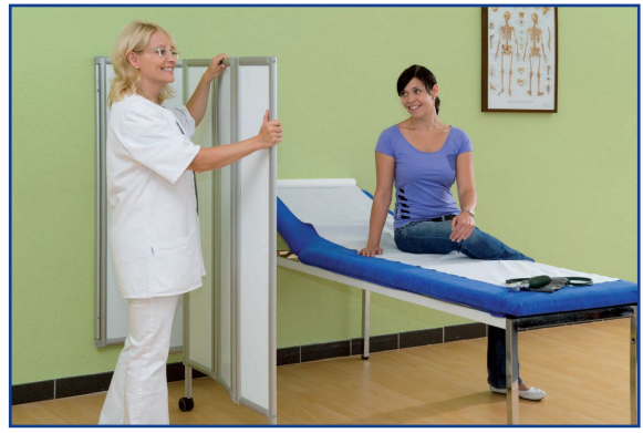
Folding Wall as Screen