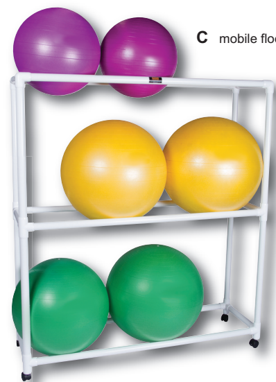
C mobile floor