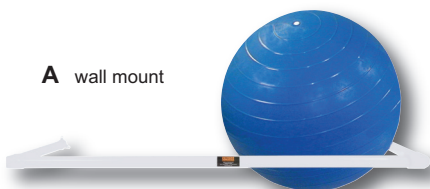
A wall mount