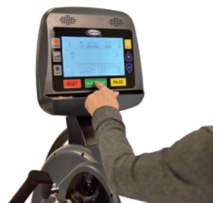
9" Color-Coded Display