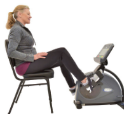
Ortho Foot Pedals Included