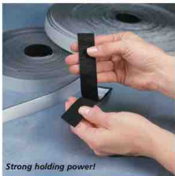
Strong holding power!

Dual Lock® Fastening System. Locks securely to itself for high shear strength application. Mates with standard loop for high-retention attachment. Self-adhesive. Similar to Poly-Lock®. Latex free. 081592799 1" x 10 yd. (2.5 cm x 9 m) $99.95