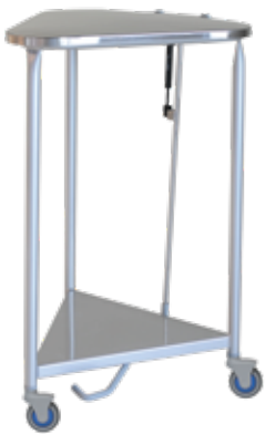
P-120-L and P-121-L