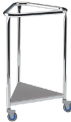
P-120 and P-121