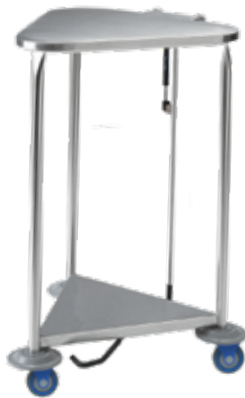
P-1120-L-SS and P-1121-L-SS