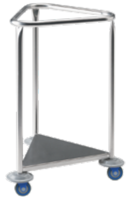
P-1120-SS and P-1121-SS