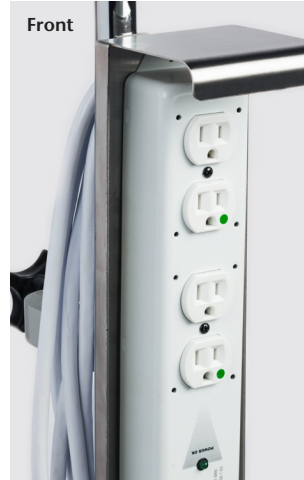
IV-50 Pole Outlet Strip