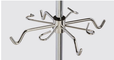
IV-55 Extra Hooks and Organizer Hooks