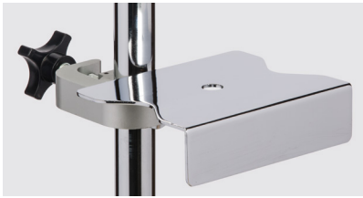
IV-46 Pump Tray Support