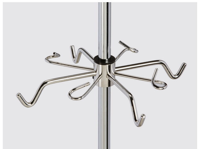
IV-55 Extra Hooks and Organizer Hooks