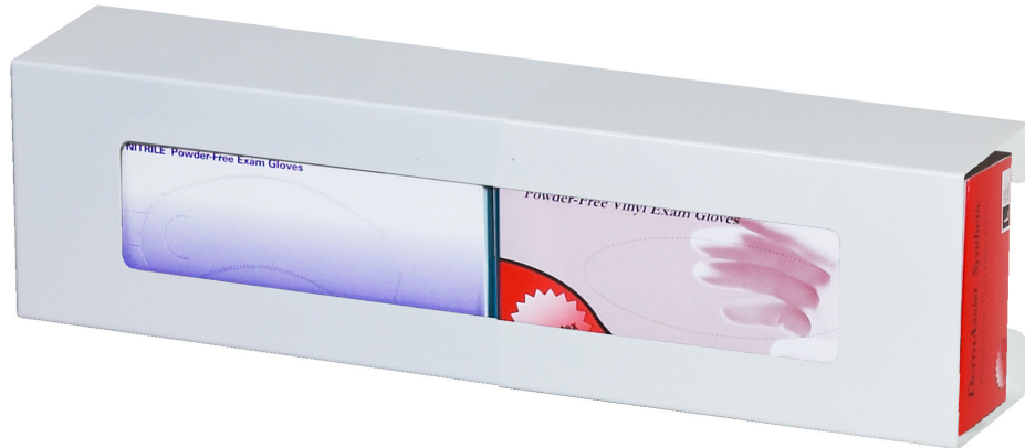
Shown in the horizontal position