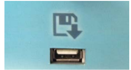
(USB Retrieval Shown)