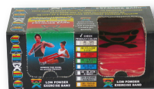
40 4-foot singles in dispenser box