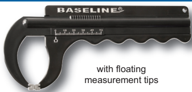
with floating measurement tips