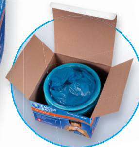
Emesis Bags Reorder No. 4709