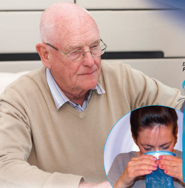
Blue Emesis Bags* Reorder No. 4707