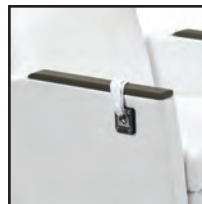
Restraint Strap Loop IRC-A-RS