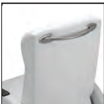
Push Bar IRC-A-PB