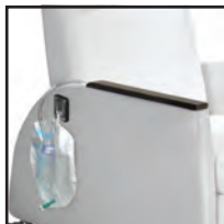
Drainage Bag Holder IRC-A-DB