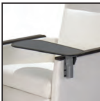
Self Storing Swivel Tablet IRC-A-ST