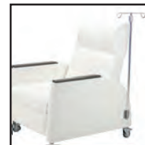
IV Pole and Holder IRC-A-IV