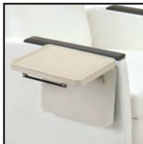
Folding Tablet IRC-A-FT