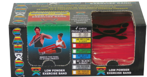
(40) 4-foot singles in dispenser box