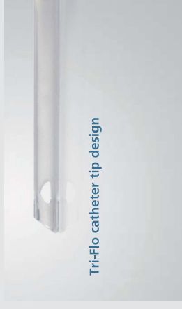
Tri-Flo catheter tip design

Depth markings from 5 to 20 cm in 2 cm increments are standard on all 5/6, 8 and 10 Fr sizes to help facilitate proper catheter placement.