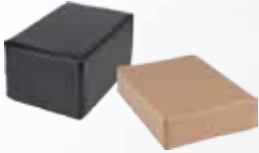
AM826: 8" x 12" x 3" Rectangle AM827: 8" x 12" x 6" Rectangle