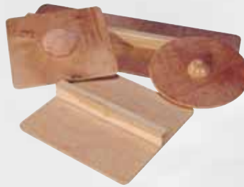
AM810: KP Board 18" x 18" (Wobbles approx. 40°) AM811: Double KP Board 18" x 36" AM812: Oblique Balancer 15 1/2" Square AM813: Round Balancer 15" 250 lb. Weight Capacity