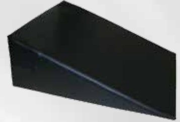
AM831: 20"W x 22"L x 8"H Wedge AM832: 24"W x 28"L x 8"H Wedge AM833: 20"W x 22"L x 10"H Wedge AM834: 22"W x 22"L x 10"H Wedge AM835: 24"W x 28"L x 10"H Wedge AM836: 24"W x 28"L x 12"H Wedge