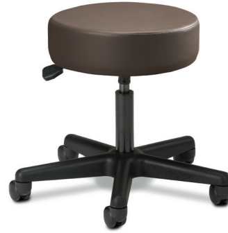
Prop 65 Warning