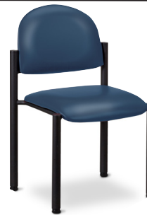
Prop 65 Warning