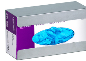
Shown in the horizontal position