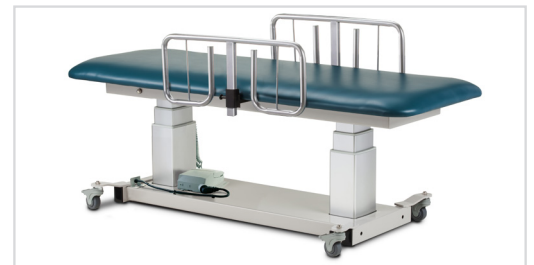
Optional Side Rails & Casters