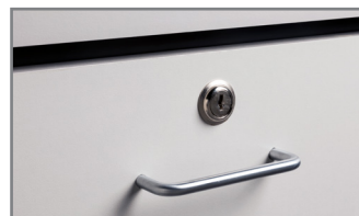
055 Drawer Locks