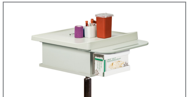
GW-2000 Single White Steel Glove Box Holder