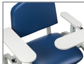
665 ClintonClean™, Armrests and Flip Arm(s)