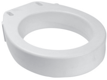
Elongated Raised Toilet Seat