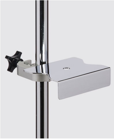
IV-46 Pump Tray Support