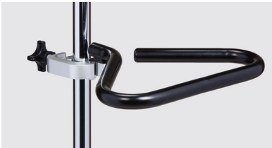
IV-43 Steering Handle