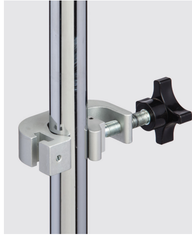
IV-41 Universal Clamp