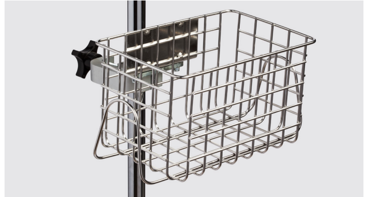
Heavy Duty Stainless Steel Wire Basket IV-51S - 14" x 8" x 8.5" IV-52S - 12" x 6" x 6.5"