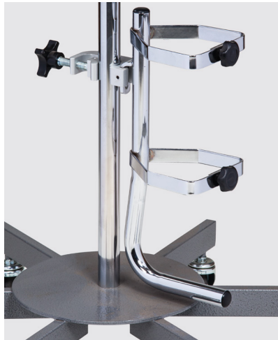
IV-44 Oxygen Cylinder Holder