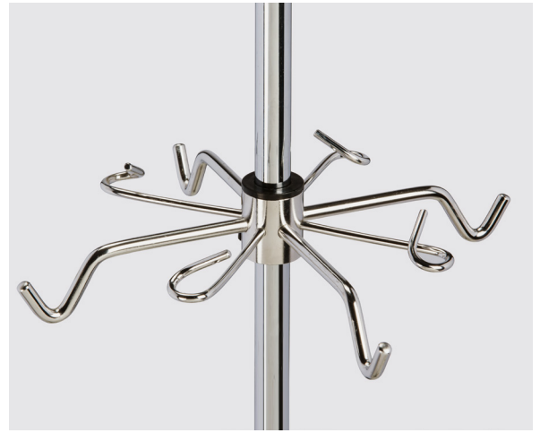
IV-55 Extra Hooks and Organizer Hooks