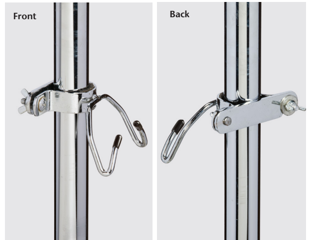
IV-56 Drainage Hook