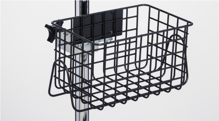
Heavy Duty Black Epoxy Wire Basket IV-51B - 14" x 8" x 8.5" IV-52B - 12" x 6" x 6.5"