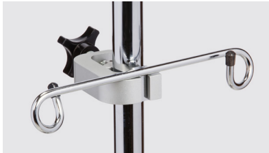
IV-57 Single Ram's Horn