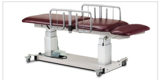
Optional Side Rails & Casters