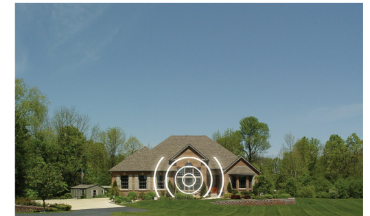
Typical Personal Emergency Response System's 2-Way Voice Communication Range (speakerphone is in the base station)