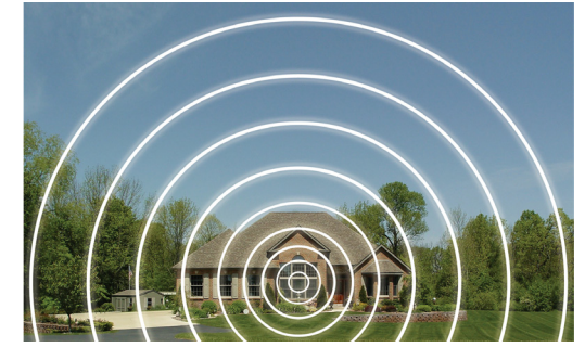
FreedomAlert's 2-Way Voice Communication Range

Because you are speaking through your pendant, FreedomAlert allows you to communicate your message from every corner of your home, outside in the yard and in the driveway. Emergencies can happen anywhere. And just one button activation.