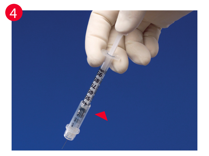
To give injection, slide shield back to its original position exposing the needle. Perform injection following facility protocol.