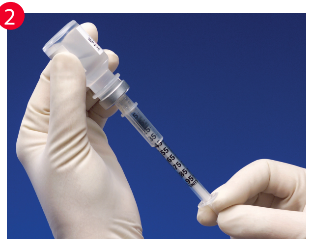
Draw medication from vial according to your facility's protocol.