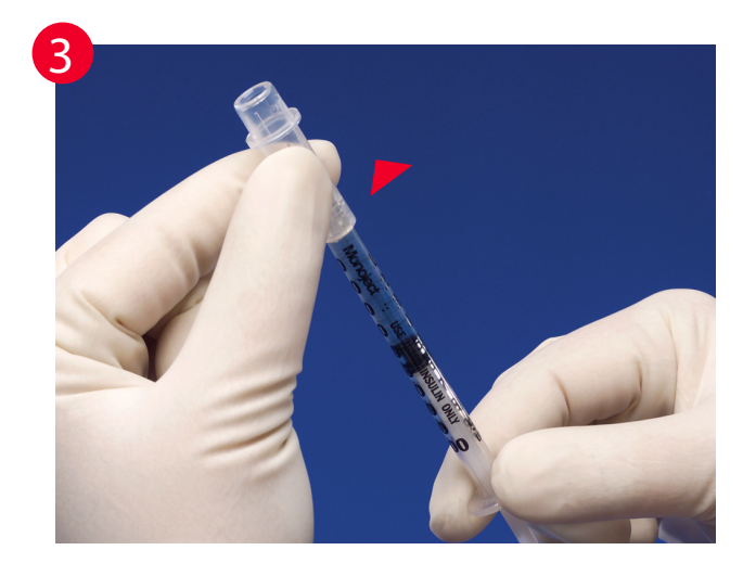
To transport syringe, extend the shield forward until you hear and feel a click. The needle is now protected for transport but the syringe is not permanently locked.