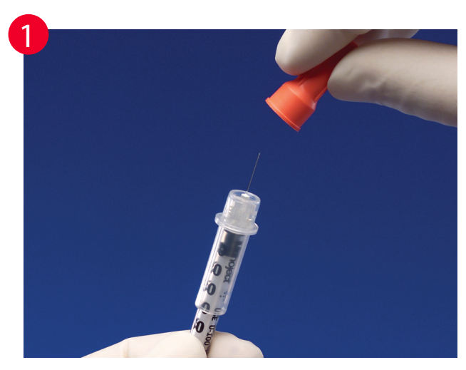
Remove syringe from package and discard tip cap. Recapping is not necessary with this syringe.