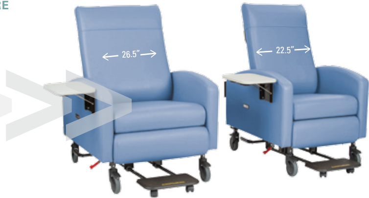
X-Large 500 lb Capacity