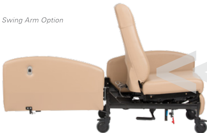
Swing Arm Option

Swing arms are ideal when easy access cleaning and transfer of patients is an important consideration.