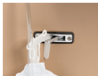
Accessory Hook (shown here with Foley bag)