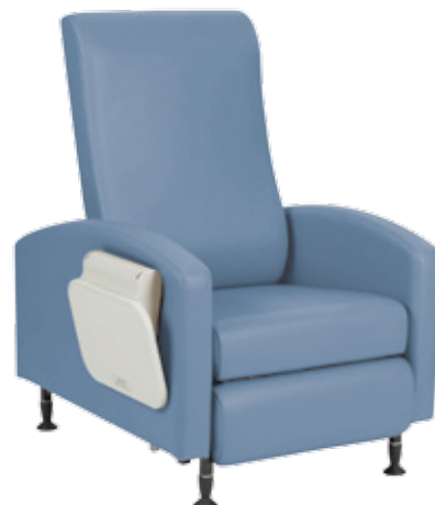
Fixed arm and pedestal foot version shown