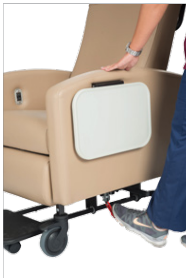
Foot lever operation

Fixed arms are suitable for most general purpose operations when transfer of patient is not required or where working space for swing arm motion is severely limited.