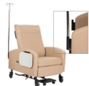
IV holder mount allows IV pole to remain relatively stationary when the swing arm (option) is in operation