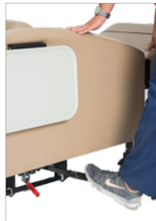
Foot lever for exclusive Secure-Glide™ Trendelenburg descent