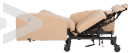
Secure-Glide™ for stress-free positioning

Exclusive to Verō , Winco introduces "Secure-Glide™" Trendelenburg control. Secure-Glide™ provides gentle patient positioning while preventing clinician strain. The controlled descent helps eliminate any need, or natural reflex, to strain to control the rapid patient positioning in emergency situations.