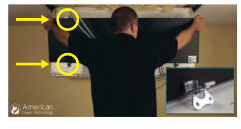
NOTE: The Snap Switch which is located in one of the top right hand corner of the UV Chamber, will be deactivated when the UV Chamber lid is removed.

Remove the cover from the UV chamber by releasing the 4 latches on the UV Chamber Lid on each side and both ends. Take care not to touch the reflective surface and leave fingerprints as you lay the cover aside.