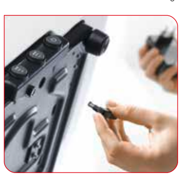
Can be operated by battery or power adapter.

Thanks to the additional measuring tape, the seca 727 enables a precise measurement of the babies' length.