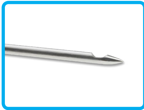
Precise side port