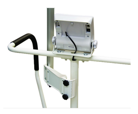
Figure 3. Secure Height Rod Assembly