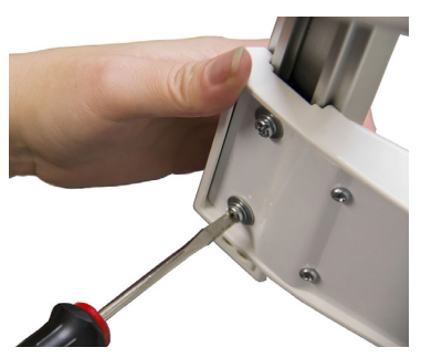
Figure 4. Height Rod Adjustment