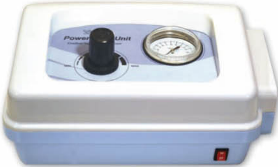
Item# P1000-G / Gradient Sequential Compressor