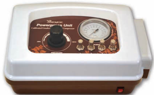
Item# P1000-CG / Calibrated Gradient Sequential Compressor (HCPCS: E0652) [ Each 4 chamber pressure controller ]