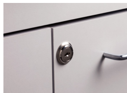
055 Door & Drawer Locks