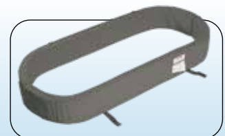
CRIB BUMPER PADS