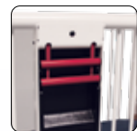
Crib Security Handle