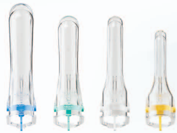
#59004 Large #59001 Medium #59000 Small #590XS Extra Small

Available in x-small (#590XS), small (#59000), medium (#59001) and large (#59004) specula