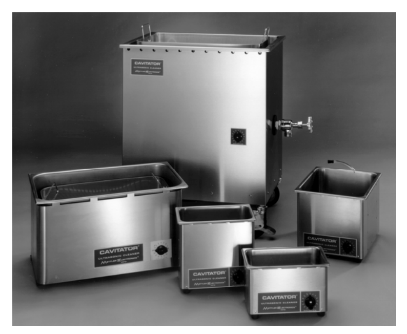
Figure 1.1 – The Cavitator Family of Ultrasonic Cleaners

Now, using your new Cavitator ultrasonic cleaner, you can take full advantage of that remarkable ultrasonic action called cavitation which gets items cleaner with less effort and time than the next best method: the scrub brush. You now have the energy to reach and clean even the tightest hidden corners between close-fitting parts that are otherwise impossible to clean. You can now loosen even strongly adherent foreign particles and rinse them away in seconds.