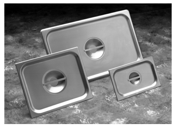
Stainless Steel Covers (#1012(NA), 1025 and 1038)