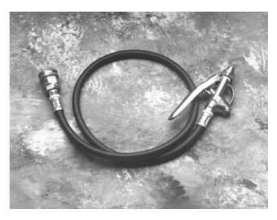
Spray Rinse Attachment (#510)