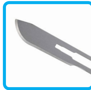
Consistent, clean edges