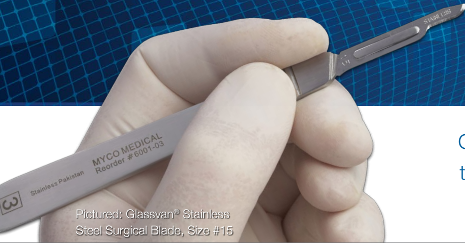
Pictured: Glassvan® Stainless Steel Surgical Blade, Size #15