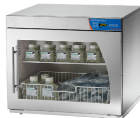
Unit shown with optional basket - set up for fluids