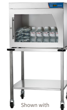
Shown with EC550BL 18" Depth Combination Warmer