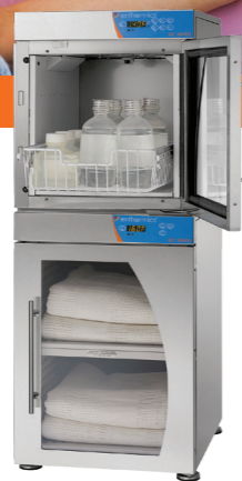
EC250L over EC350