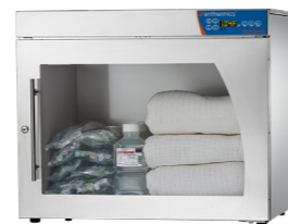
Unit shown with fluid bottles, bags and blankets for illustration purposes only