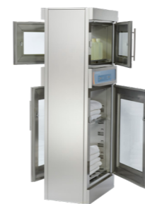
Shown as optional pass-through cabinet