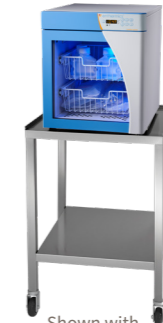
Shown with DC250L Fluid Warmer