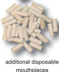
additional disposable mouthpieces