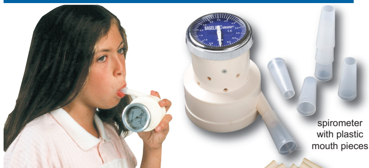
spirometer with plastic mouth pieces