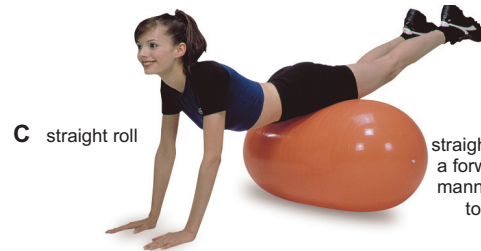
C straight roll

straight roll only moves in a forward and backward manner making it easier to use than a ball