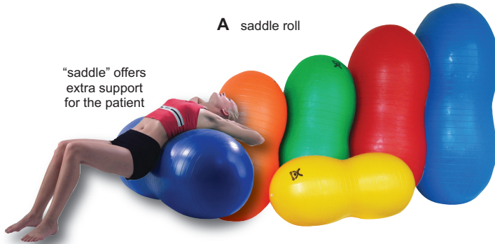
A saddle roll

"saddle" offers extra support for the patient