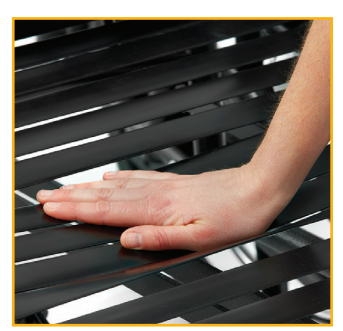
Comfort Tension Seating® increases support as well as sitting tolerance