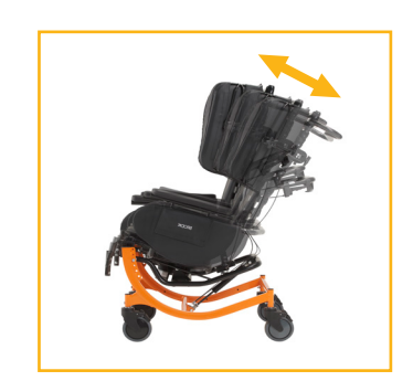
Optional dynamic rocking feature calms and creates contentment