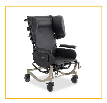
New frame design, including adjustable wings and tall back option