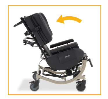
Front pivot seat tilt maintains a proper position for self-propulsion