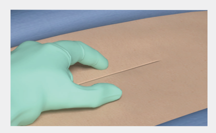
Approximate the wound edges with gloved fingers or forceps.