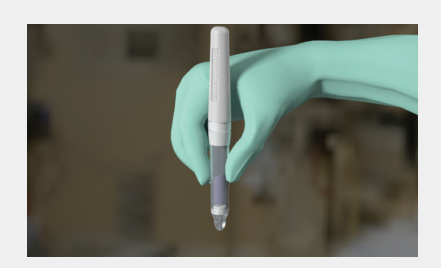
Hold the applicator away from the patient with the tip pointed downward.