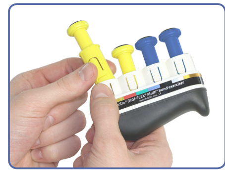
pinch release tabs and pull up to remove button