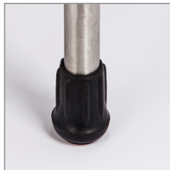
24 Optional Rubber Tips