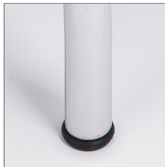
23 Optional Glides C