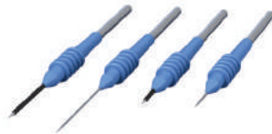
Disposable SuperCut™ Needles Electrodes †