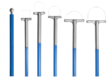
Disposable LLETZ/LEEP Loop and Ball Electrodes †