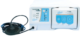
SE02 Smoke Evacuator †