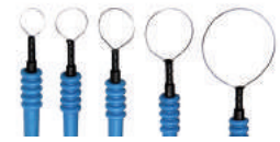
Disposable Dermal Loops †