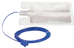
ESREC - Split Disposable Return Electrode with cord †