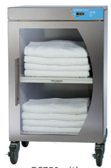
EC750 with optional casters