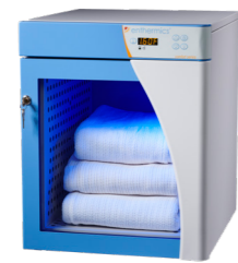
DC250 with optional lock

All blanket warmers utilize WarmSafe zone heating to ensure every blanket is safely and evenly warmed. With no fans or moving parts on the tabletop blanket warmers, they are engineered for years of reliable operation.