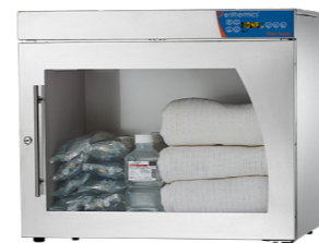
Unit shown with fluid bottles, bags and blankets for illustration purposes only