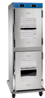
Shown with optional bumper