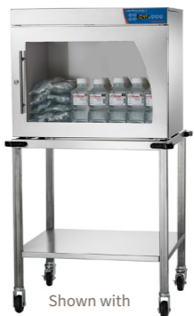
Shown with EC550BL 18" Depth Combination Warmer