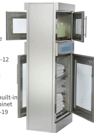
Shown as optional pass-through cabinet