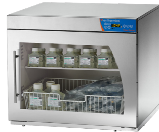
Unit shown with optional basket - set up for fluids