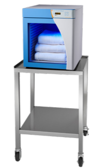
Shown with DC250 Blanket Warmer